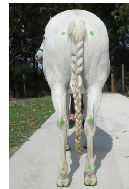
Conformation Analysis Hind