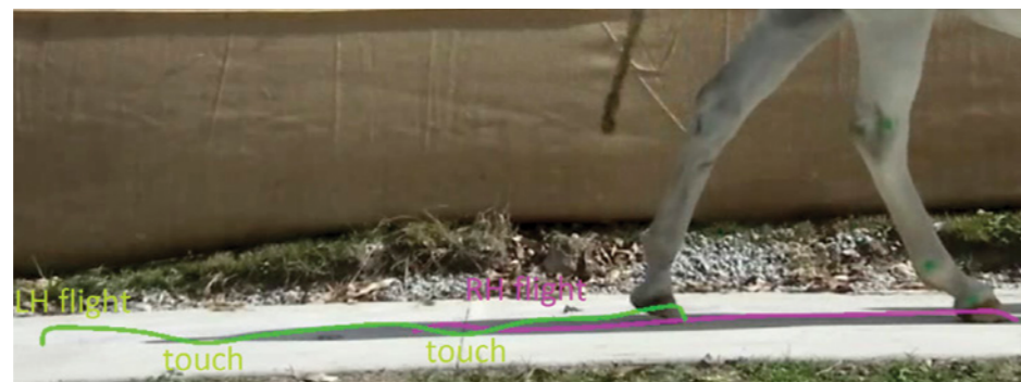
This image shows the arc of the hind limb flight in walk.

Currently most practitioners watch horses with their naked eyes. While this is adequate for ascertaining