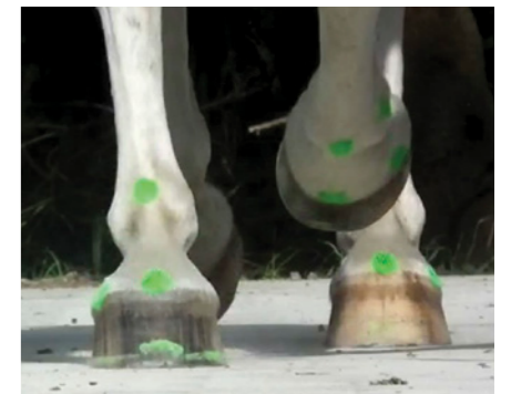
Hoof Assessment Trot

A growing area for A.C.A.T.T. is the use Video Gait Analysis in selection of race and performance horses.